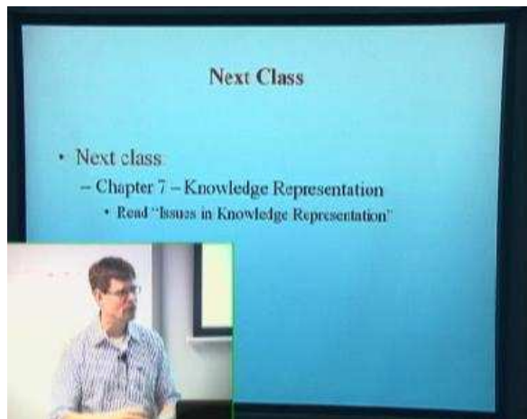
Scenes from a Cyber Classroom recording.